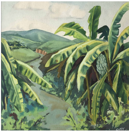
May Belle Gay AL Art League PR-2020-1-9

High-resolution digital images and captions for the following photographs are available for use. Send image requests to M.Harris@DixieArtColony.org . Additional images are also available.