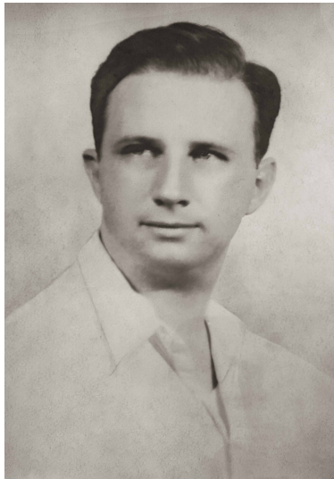
C.A. Moon PR-1-2020-1

High-resolution digital images and captions for the following photographs are available for use. Send image requests to M.Harris@DixieArtColony.org . Additional images are also available.