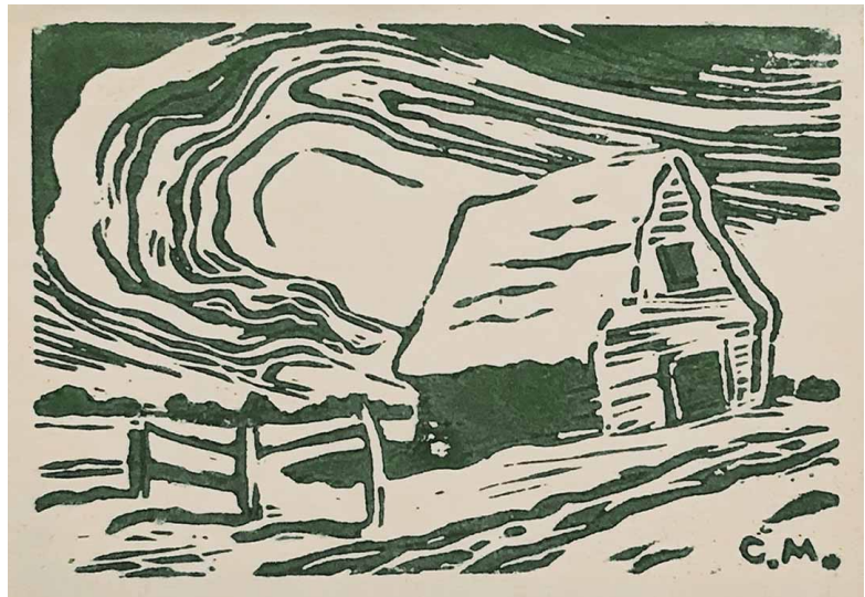
C.A. Moon PR-1-2020-2