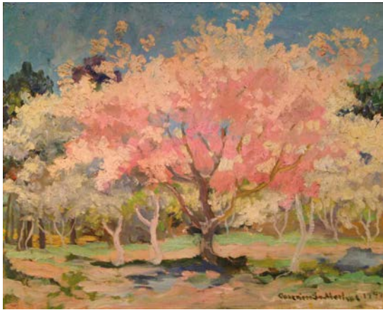
Genevieve Southerland 3-Art

High-resolution digital images and captions for the following photographs are available for use. Send image requests to M.Harris@DixieArtColony.org . DAC Foundation and Elmore County Art Guild logos are also available upon request.