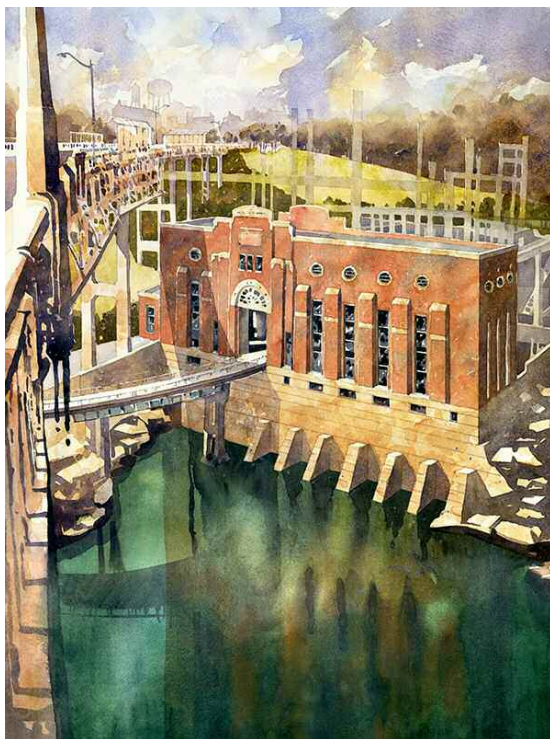
Ian Stewart DAC-NG 1-Art

High-resolution images and captions are available for use. Send image requests to M.Harris@DixieArtColony.org .