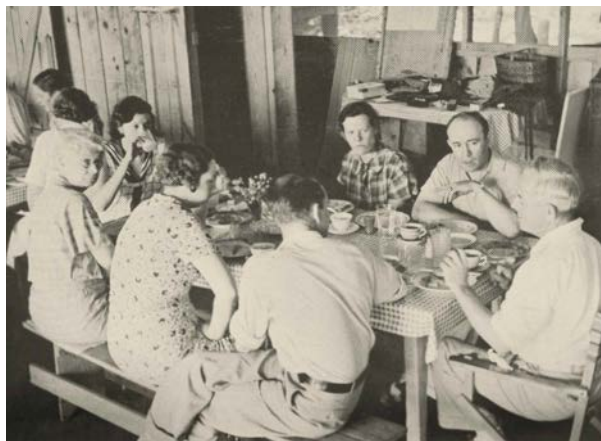
Nobles Ferry 4-AP