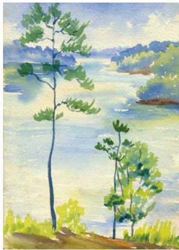
Warree LeBron 8-Art