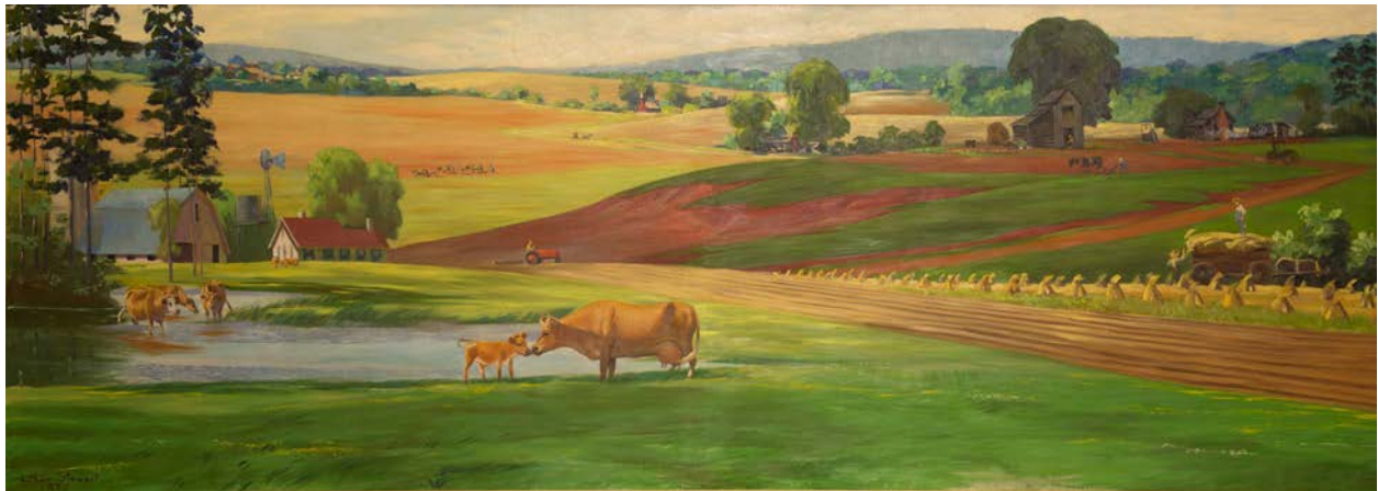
Kelly Fitzpatrick / Arthur Stewart: Pastorial Scene, 1-Art

High-resolution digital images and captions for the following photographs are available for use. Send image requests to M.Harris@DixieArtColony.org. DAC Foundation and Elmore County Art Guild logos are also available upon request.