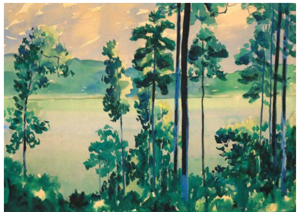
Kelly Fitzpatrick 11-A