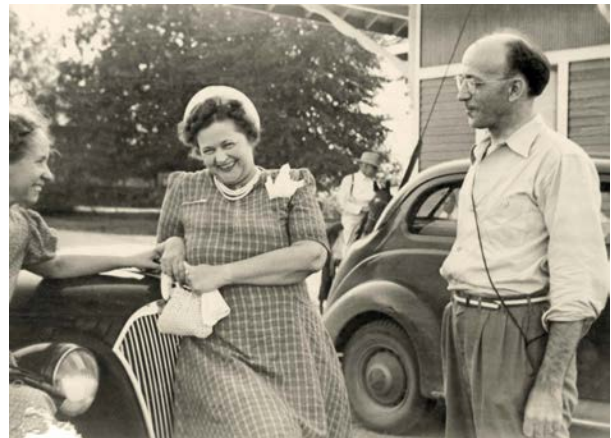
Deatsville Train Depot 7-AP