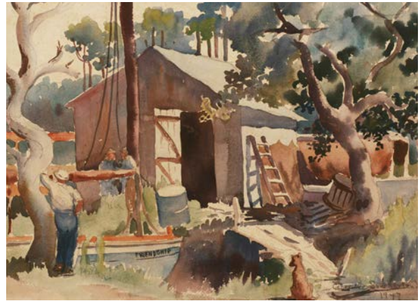
Genevieve Southerland 4-Art