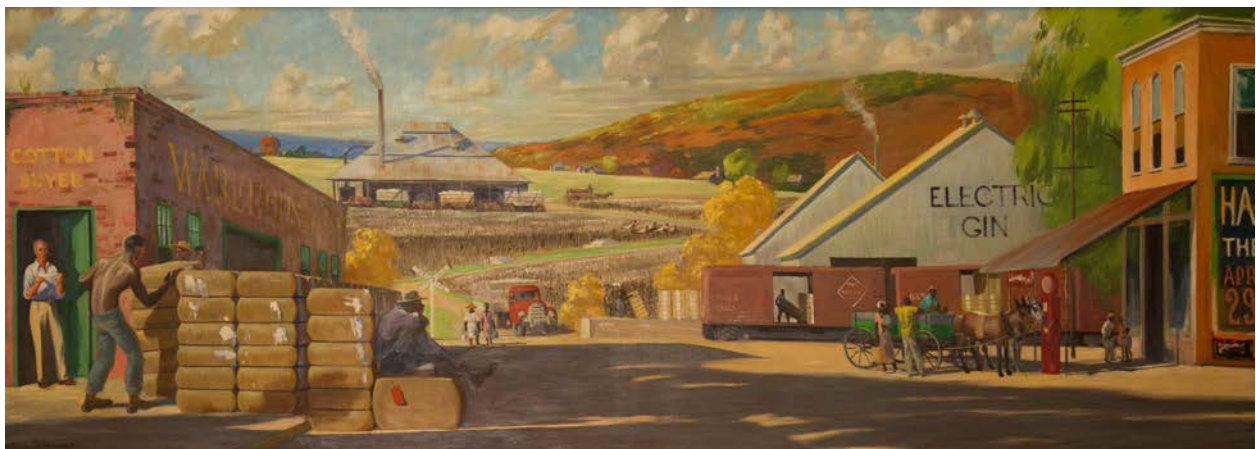
Kelly Fitzpatrick / Arthur Stewart: Tallassee Cotton Gins, 1-Art

High-resolution digital images and captions for the following photographs are available for use. Send image requests to M.Harris@DixieArtColony.org . DAC Foundation and Elmore County Art Guild logos are also available upon request.