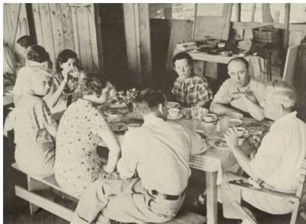
Nobles Ferry 4-AP