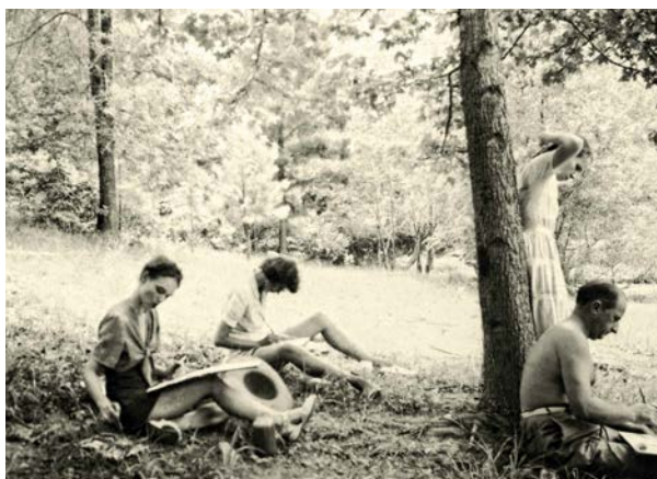
Shiney Moon 8-AP