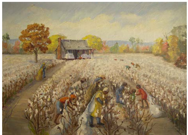
Warree LeBron 6-Art