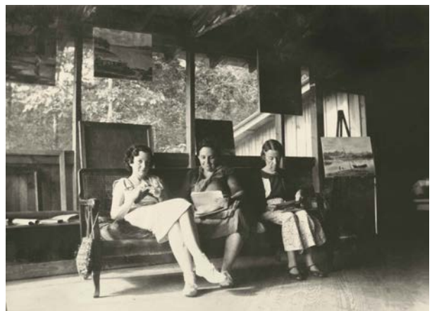
Nobles Ferry 5-AP