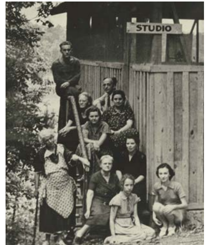
Nobles Ferry 3-AP