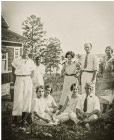
Cherokee Bluffs 1-AP

High-resolution digital images and captions for the following photographs are available for use. Send image requests to M.Harris@DixieArtColony.org . DAC Foundation and Elmore County Art Guild logos are also available upon request.