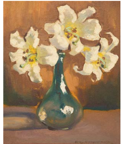
Kelly Fitzpatrick 9-Art